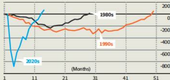
Employment moves during recession ('000s)